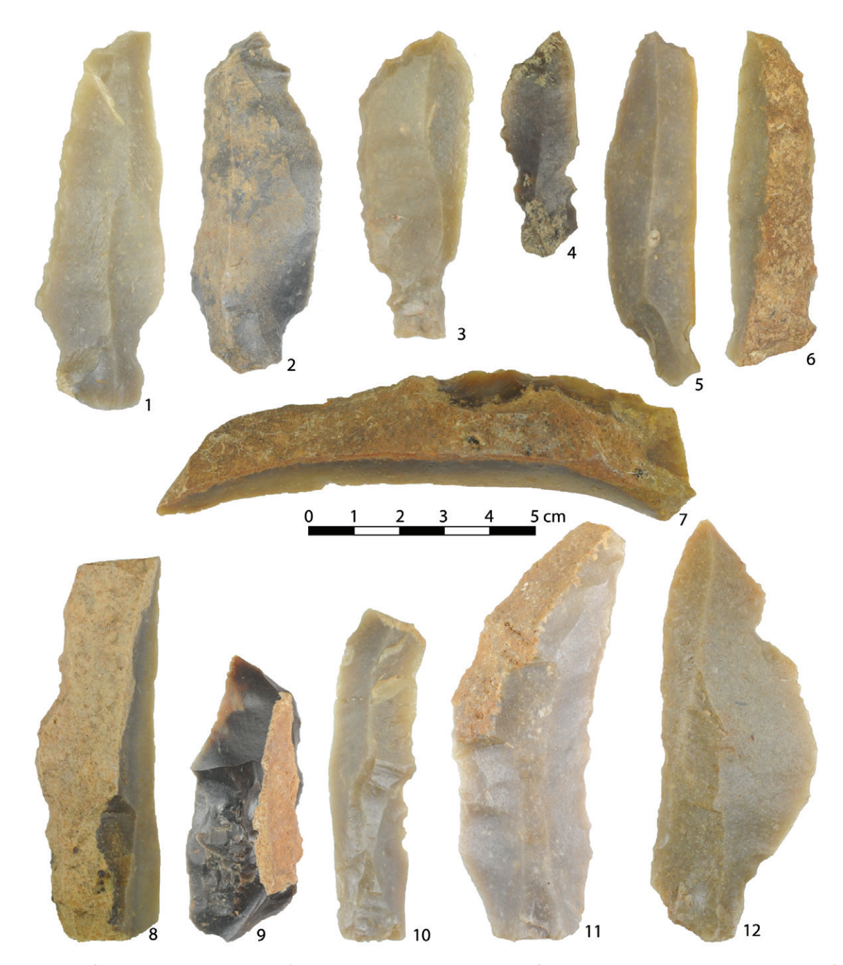
Fig. 65.1. Rouffignac, layer 5b. Some of the blanks published as Rouffignac backed knives: 1–6. true Rouffignac backed knives; 7–9. backed knives; 10. denticulated blade; 11–12. blade-scrapers.

reconstruction of the reduction sequences that provided the blanks used for the manufacture of backed knives (Visentin 2018). In total, the lithic assemblage includes 1981 artefacts, among which 33 cores, 18 armatures, 17 microburins, and 86 retouched tools. Technological data suggest the presence of a single reduction sequence devolved at the exploitation of the large cherty nodules, in which the cave is extremely rich. These nodules were collected either in primary or