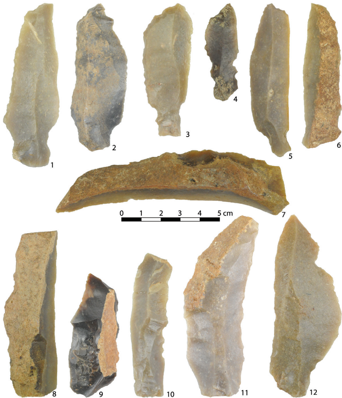
Fig. 65.1. Rouffignac, layer 5b. Some of the blanks published as Rouffignac backed knives: 1–6. true Rouffignac backed knives; 7–9. backed knives; 10. denticulated blade; 11–12. blade-scrapers.

reconstruction of the reduction sequences that provided the blanks used for the manufacture of backed knives (Visentin 2018). In total, the lithic assemblage includes 1981 artefacts, among which 33 cores, 18 armatures, 17 microburins, and 86 retouched tools. Technological data suggest the presence of a single reduction sequence devolved at the exploitation of the large cherty nodules, in which the cave is extremely rich. These nodules were collected either in primary or