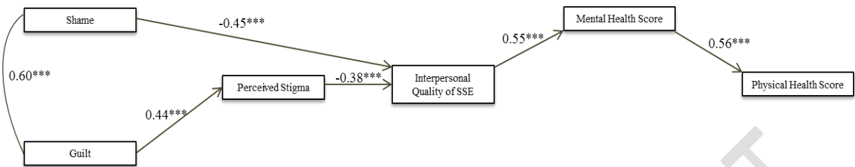
Figure 2 : Standardized solution for the final observed model