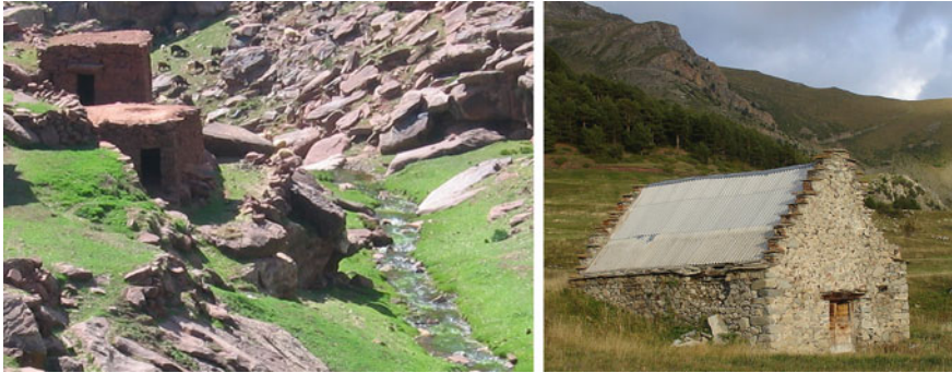
Fig. 5.3 On the left a sheepfold with a horizontal roof in the High Atlas, and on the right a sheepfold with a stepped roof in the Pyrenees

purchase material from the outside (cement, iron, aluminium, etc.), which is more obvious in the Pyrenees where the shepherds are more capitalized, notably as a result of European subventions which support their way of life (even if always insufficiently), whereas in the Moroccan case they are absolutely inexistent (Fig. 5.3).