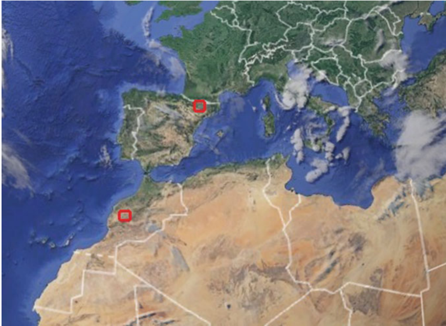
Fig. 5.1 Map with the two areas of study marked in red, the Spanish Central Pyrenees and the Moroccan High Atlas of Marrakech