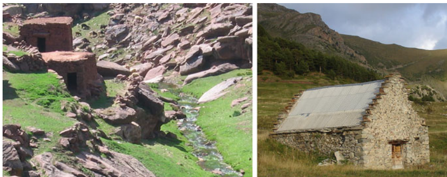
Fig. 5.3 On the left a sheepfold with a horizontal roof in the High Atlas, and on the right a sheepfold with a stepped roof in the Pyrenees

purchase material from the outside (cement, iron, aluminium, etc.), which is more obvious in the Pyrenees where the shepherds are more capitalized, notably as a result of European subventions which support their way of life (even if always insufficiently), whereas in the Moroccan case they are absolutely inexistent (Fig. 5.3).