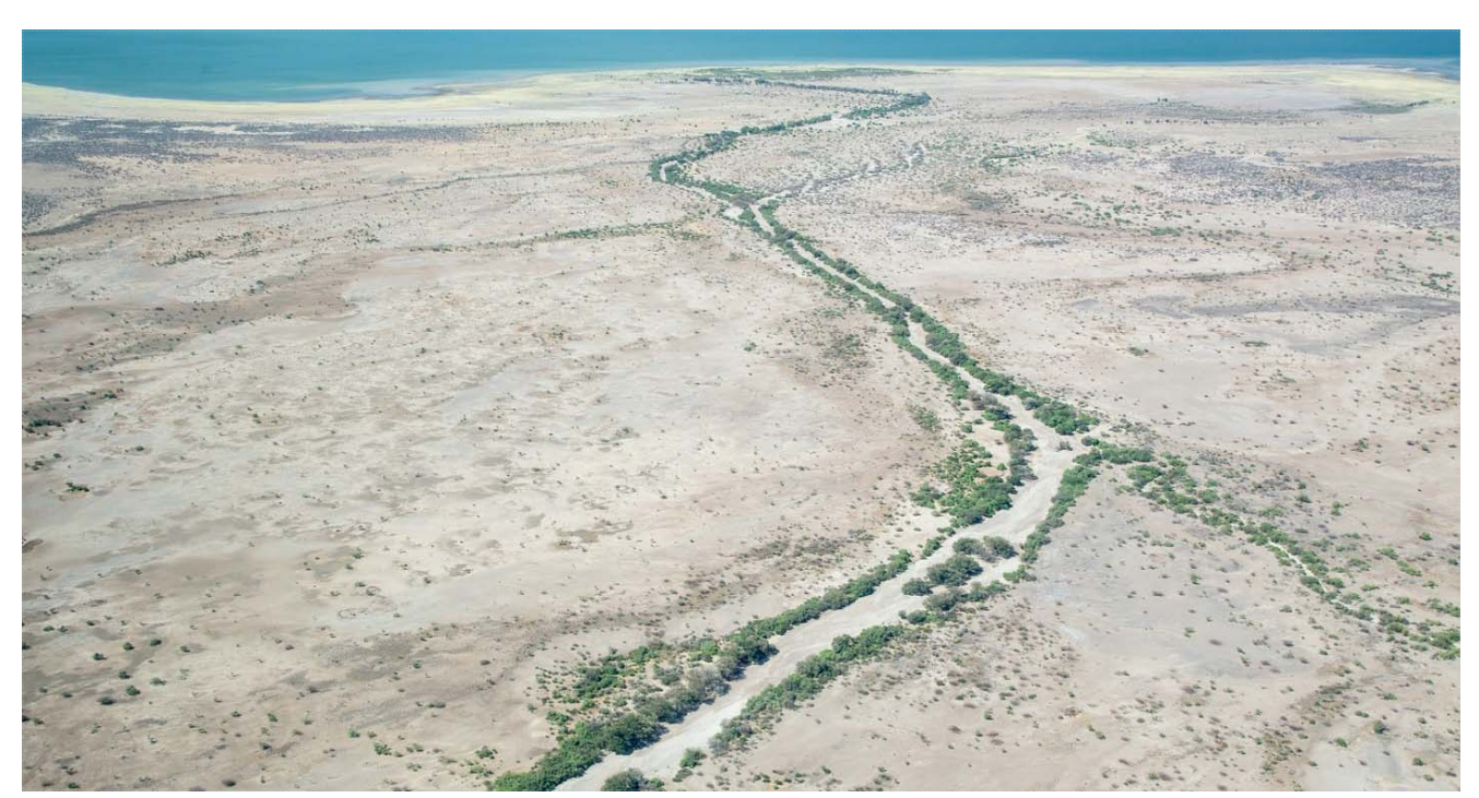
Figure 2. Seasonal river in Ileret with lake Turkana in the background