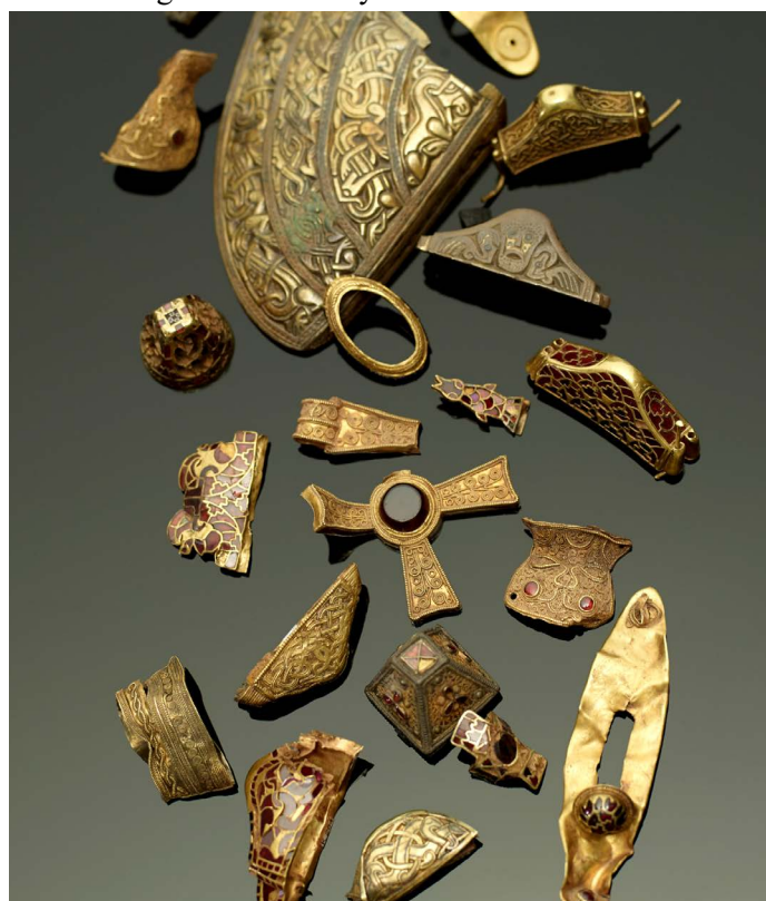
Gold objects of the Staffordshire Hoard.