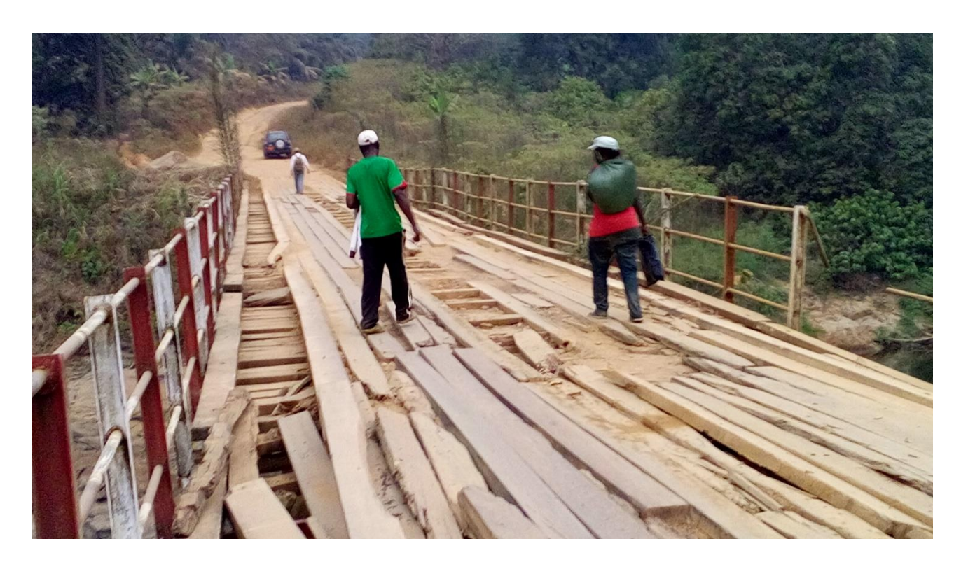
Picture 2. This decayed bridge deck illustrates the constraints that hamper mobility and, therefore, face-to-face meetings. This photography has been taken in Mabombe (district of Loum) in 2016.