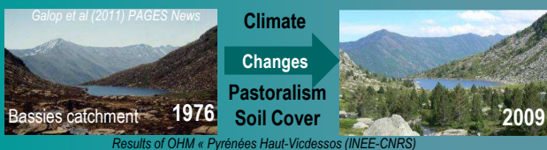
Results of OHM « Pyrenees Haut-Videssos (INEE-CNRS)