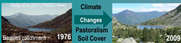
Results of OHM « Pyrenees Haut-Videssos (INEE-CNRS)