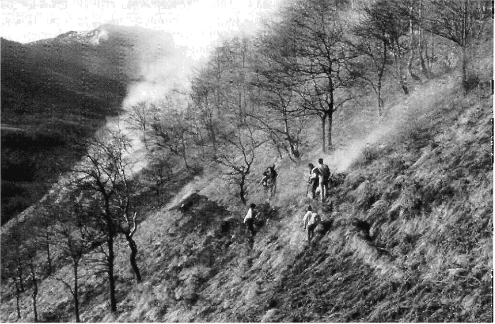
Fig. 7.3. Winter burning of bracken and Brachypodium in a pastoral oakland, Lavedan (Hautes-Pyrénées), 1994. (J.P. Métailié).

August–September, but many sources relate the collection of the leaves every year. In general, people brought together branches and foliage to make faggots and stored them in the barns or in the plots; sometimes it was even stored in the tree, beyond the reach of the cattle (in Occitan: la fullera , Fig. 7.4) and given to the animals throughout January and February. The large branches of ash were used to make firewood, fences, plates and tools (cattle collars, rakes, forks, etc.). In the cultivated soil (cereals, potatoes, etc.) the obligation of common grazing prevented the construction of fences to allow free grazing after harvesting. The meadows were, on the other hand, for private use, and it was important to protect them from the bordering herds from spring onwards and to maintain their owners' own cattle in winter. 17