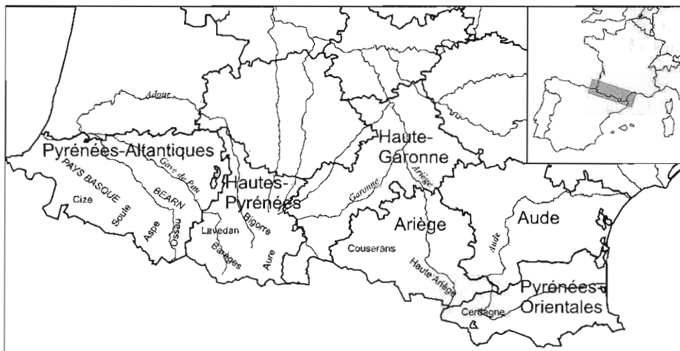
Fig. 7.1. Locality of the places discussed in the text.

ago. Rural emigration began in the 1830s in the eastern part of the chain (as in all the French Mediterranean mountains), but it only spread from the years 1880–1890, provoked by agricultural crises of the end of the 19th century. Until the 1930s, rural emigration mainly affected the poorest classes of the population: peasants without land, small artisans, and the workmen in metallurgical industries in decline. This emigration and the losses of World War I had paradoxically little consequence on the landscape dynamics because the main farms were maintained. Most of the great geographic and ethnographic investigations on the pastoral society were carried out during this time (Cavaillès, 1930; Lefebvre, 1933; Chevalier, 1952), and aerial photographs of 1942–1948 offer the vision of an agrosilvopastoral landscape still well maintained.