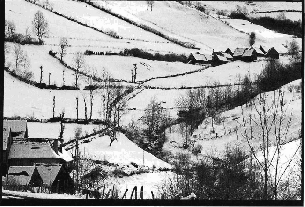
Fig. 7.5. Landscape of Pyrenean bocage in winter: hamlet and barns of Laspe, in the Biros valley (Ariège), 2002.

practices are disappearing, but the social consensus on the landscape moves towards an assumption of management by the local communities, in forms related to agro-environmental policies. In the case of fire, it is