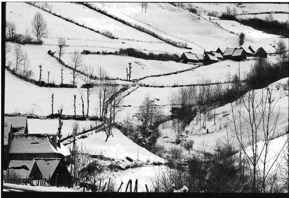
Fig. 7.5. Landscape of Pyrenean bocage in winter: hamlet and barns of Laspe, in the Biros valley (Ariège), 2002.

practices are disappearing, but the social consensus on the landscape moves towards an assumption of management by the local communities, in forms related to agro-environmental policies. In the case of fire, it is